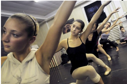
Youth Ballet members rehearsing at the Albano Ballet studios in Hartford