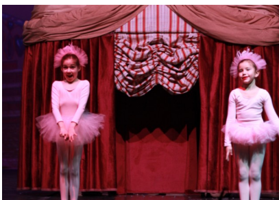
Albano Ballet children's division performing in Albano's Nutcracker